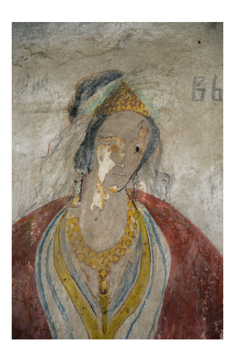
Figure\ 4:\ The\ porch\ of\ Curțişoara\ parich\ church,\ North\ Oltenia.\ Photo\ taken\ by\ \Serban\ Bonciocat