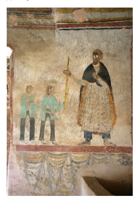
Figure \ 5: The \ same \ porch \ of \ Curțişoara \ parich \ church, \ North \ Oltenia.