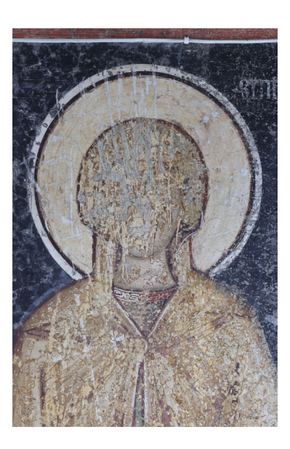
\label{thm:continuous} \textit{Figure 2: The exterior wall of Surpatele Monastery church, North Oltenia.

There is an intriguing coincidence between the two cases: both (the monastery and the skete) have been deserted from the end of the 19th century (exactely the period of the ritual's attestations in Hasdeu questionnaires) untill the beginning of the 20th century. Even if we can not generalize, it's for sure that the lack of the edifice surveillance favoured gestures which should have been performed secretly before (and after), since they probably were forbiden otherwise. In the mean time, the special status assigned to the ruins of a church - a liminal space characterized through a sort of ambiguous sacredness (neither an active church, nor a common place) – probably encuraged the practice of rituals which are, at their turn, ambiguous and with a borderline character.