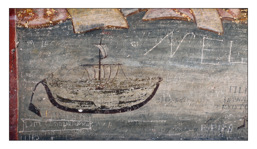
Figure 1: The porch wall of Polovragi Monastery church, North Oltenia. Photo made by \ erban Bonciocat in 2013

Even if all three situations are attested in Romania, the practices I will discuss are not included in the above classification, namely the popular ritual of taking out pieces of binder from the icons painted on the churchs'walls.